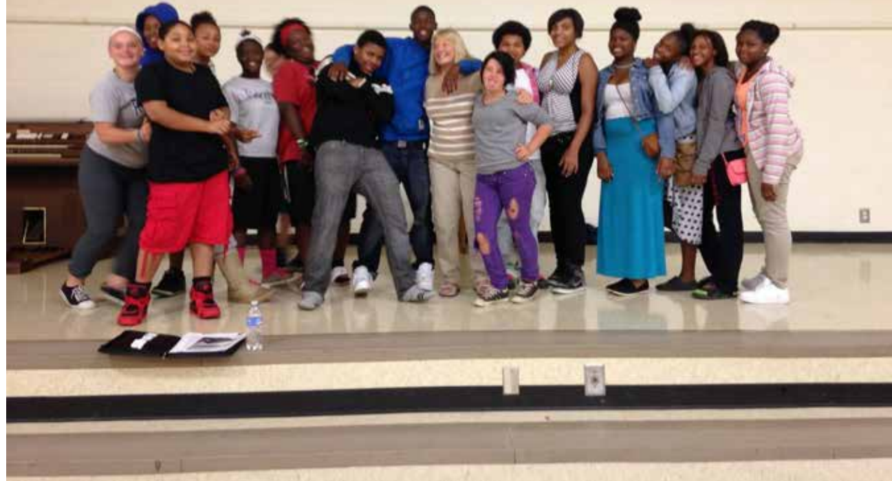
Run the Race Center in the Hilltop