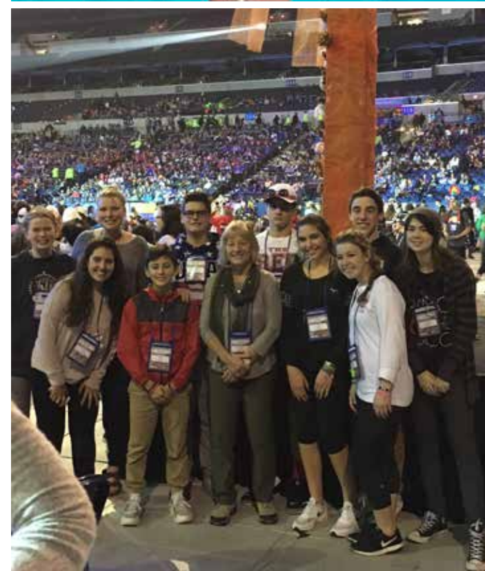
National Catholic Youth Conference

Our challenge today is to help young people know what real love is and to recognize how without a core belief system, it is difficult